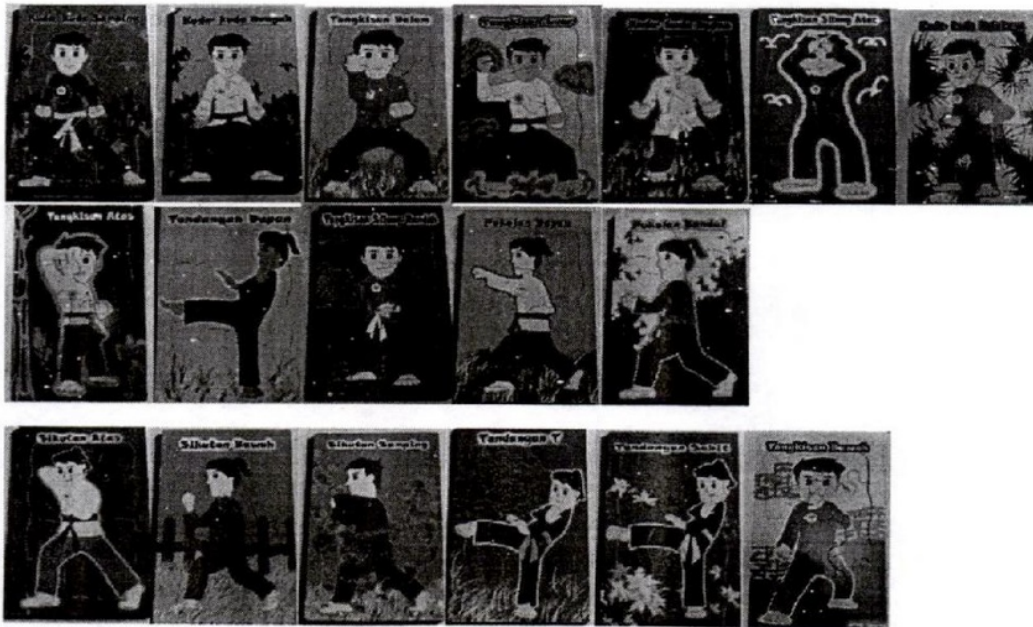
Picture. Puzzle display and coloring book After Final Revision